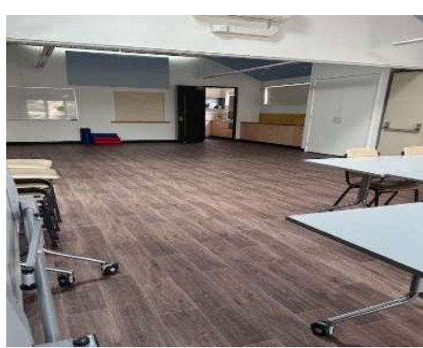
Combined Activity Room 1&2