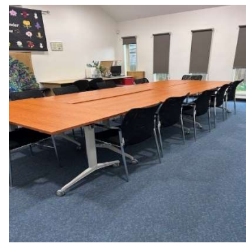
Meeting Room 1