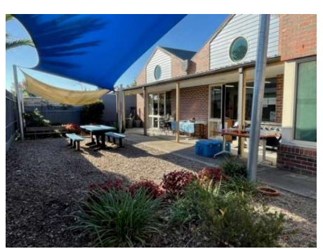
Oakwood Room - Courtyard