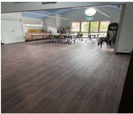
Combined Activity Room 1&2