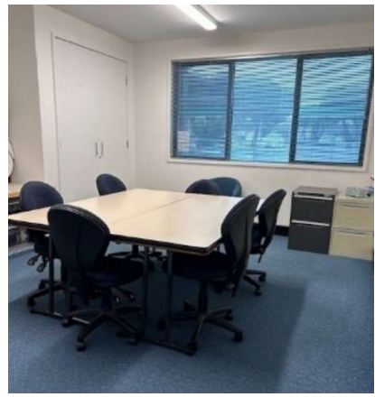
Meeting Room 2